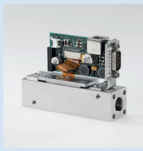
High-tech in a very compact design The flow meters and controllers use advanced MEMS technology

Through the application of high-precision MEMS technology (CMOS sensors), the thermal flow meters and controllers from Vögtlin Instruments AG set new standards in terms of response characteristics and measuring accuracy, and are characterized by maximum convenience: